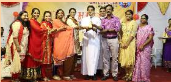
Christ The King Church, Bhandup