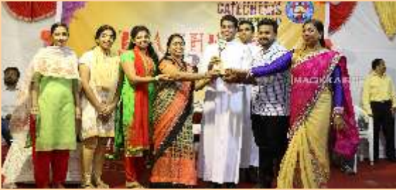
St. Joseph's Church, Airoli