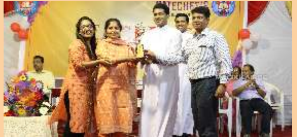
St. Jude Center, Sanpada