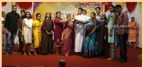
Immaculate Conception Church, Dombivli