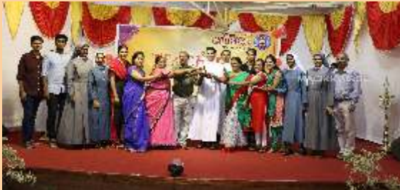
St. George Church, Panvel