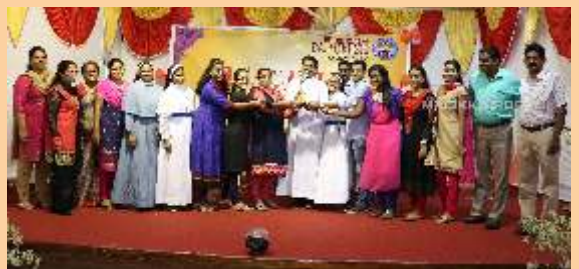
St. Thomas Church, Mira Road