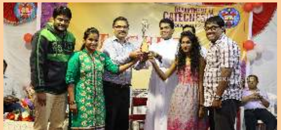
Infant Jesus Church, Vikhroli