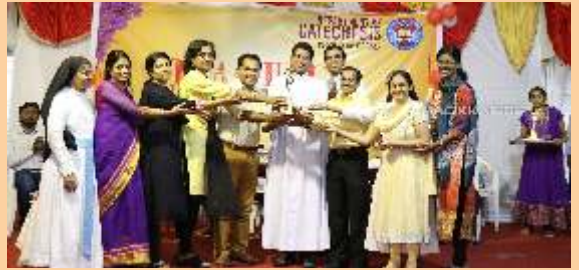
St. Josephs Church, Powai