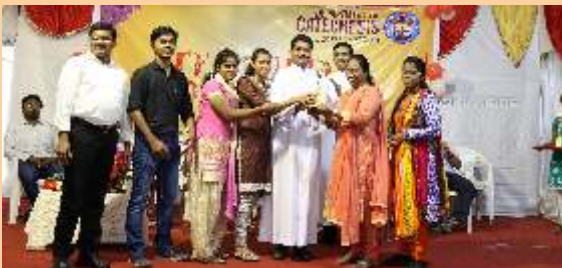
St. Barthlomeo Church, Kalyan East