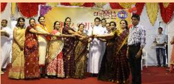
Amalamatha Church, Mulund